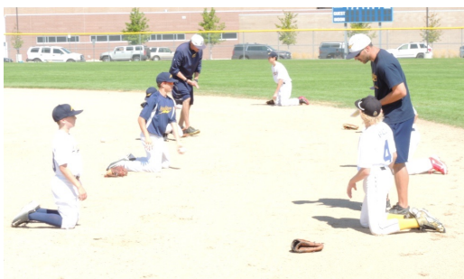
Individual work with coaches